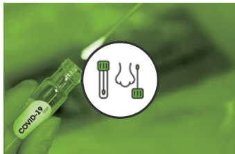
PCR NASAL SWAB TESTING