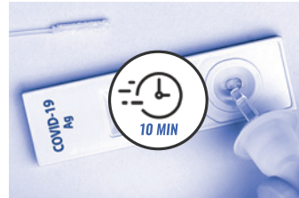
RAPID ANTIGEN TESTING