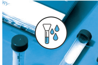
PCR SALIVA TESTING